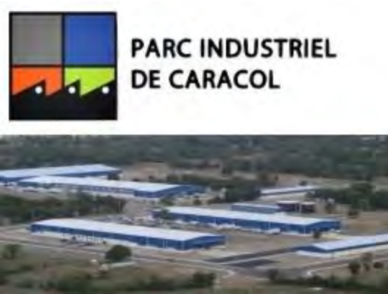
PARC INDUSTRIEL DE CARACOL

Exports to the US: 96% of their production